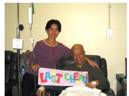
Flashback to the day I finished my chemotherapy for those who never saw me bald!

As for me, much of last year (2007) I had been on medical leave to undergo and recuperate from chemotherapy following the operation to remove a malignant lump in November 2006. I only got back to work in May to a new position as Special Projects Editor as the Sunday Star editorship had passed on to someone else in my absence. In the new year, however, I was surprisingly promoted to be Deputy Executive Editor. Although there is no clear portfolio, I am currently involved with the Business section of the paper. I am writing more these days and I thank God for the opportunity to bring some heart and soul into the heart of Corporate Malaysia being where I am.