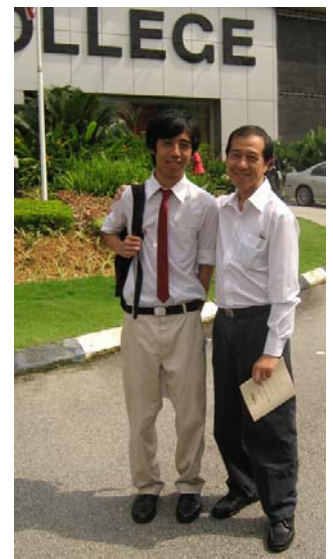
Top student second year running and dad even dressed up for the event!