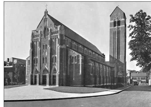
Immaculate Conception Parish

Along the outer walls of the aisles are placed the stained glass windows purchased for the 1872 church by Father O'Callaghan. The columns separating the nave from the aisles bear upon their capitals large figures of winged angels that support the main ribs of the groined ceiling of the nave. Beautiful windows in the clerestory afford the necessary light for the vaulted roof of the nave. The ceilings in the aisles are likewise finely vaulted and groined. At the facade the three entrances are arched and above them are mullions and columns rising upwards to a traceried cornice. The apex of the roof, rising sixty feet above the