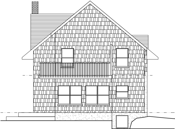
3 EAST ELEVATION A3.0 1/4" = 1'-0"