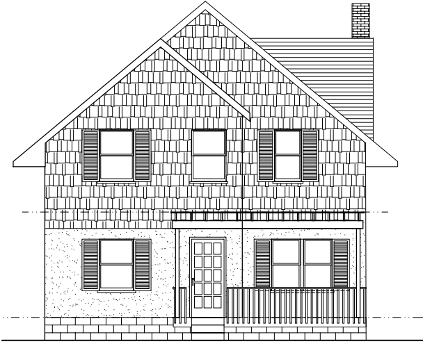
1 WEST ELEVATION A3.0 1/4" = 1'-0"