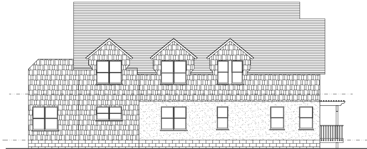
4 NORTH ELEVATION A3.0 1/4" = 1'-0"