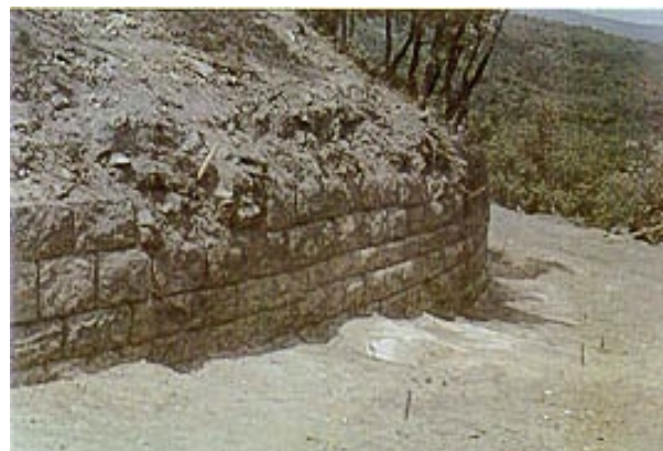
Starosel Temple-Tomb, August 2000