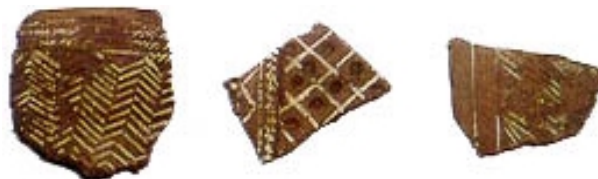
Encrusted pottery from Dubene-Sarovka. Dubene-Sarovka, the biggest Early Bronze (later 4 th - 3 rd Millennium BC) village centre in Northwestern Thrace has been documented, with well-preserved architectural remains of rectangular and apses wattle-and-daub and clay-beaten houses, numerous interesting finds, evidence of metallurgical activity and active contacts with close and distant cultures.