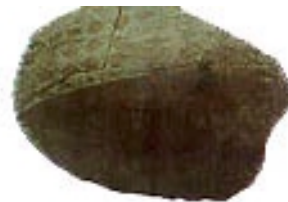
Dubene-Sarovka. An encrusted bowl fragment from the excavations in 2000.