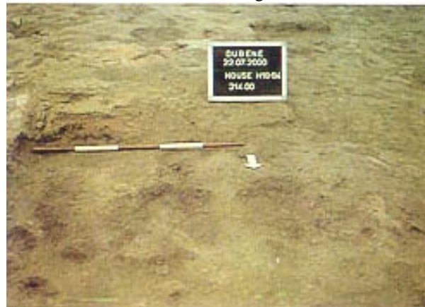
Dubene-Sarovka IIB. A burnt house floor.