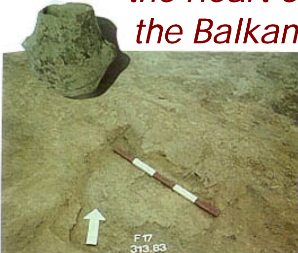
A partially preserved house wall from phase IIB2. Excavations in 2000.

The Early Bronze Age Village centre of Dubene-Sarovka in the for-Sushtinska Sredna Gora Mountains (Karlovo Municipality)