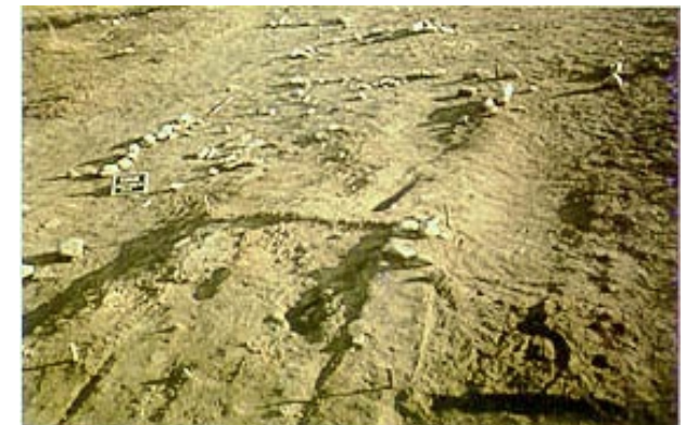
Dubene-Sarovka. July 2000. Full investigation of Apses-House No. 1.