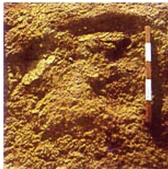
A pithos from Dubene-Sarovka IIB2.

You are welcome to visit Dubene-Sarovka's finds in the Historical Museum of Karlovo. The Starosel temple-tomb is not far from the main road from Hissar to Plovdiv.