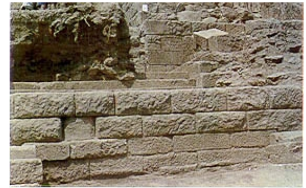
Starosel Temple-Tomb. The earth of the tumulus is still in front of the entry. August 2000.

DUBENE-SAROVKA and STAROSEL TEMPLE-TOMB are some of the greatest discoveries of Bulgarian archaeology at the end of the 20 th century. They open a new page of the investigation of the Central Balkans during prehistory and classical Antiquity. They reveal the significant participation of the population from both sides of the eastern Sushtinka Sredna Gora Mountains in the cultural-historical development of Upper Thrace. For millennia time has hidden unique and sensational secrets of prehistoric, bronze age and classical Thracian societies that lived there. These have only now been unearthed.