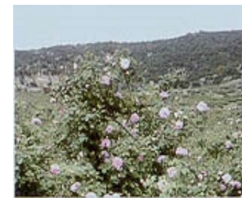
Karlovo Valley of the Roses

Fabulous Archaeology, modern art in the Karlovo City Gallery, wonderful hotels, restaurants and shops will make your trip unforgettable.