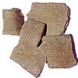
Encrusted and corded pottery from phase IIB2.

The Early Bronze Age Village centre of Dubene-Sarovka in the for-Sushtinska Sredna Gora Mountains (Karlovo Municipality)